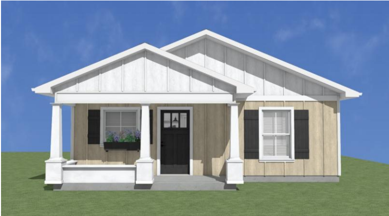
Board & Batten