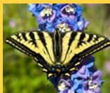
Western Tiger Swallowtail ( Papilio rutulus )