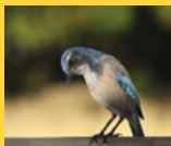
California Scrub Jay ( Aphelocoma californica )