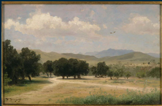
Circa 1870 landscape painting by Hermann Herzog of oak trees in a valley near Los Angeles.

We need your help! The mountains, foothills, and valleys of Los Angeles County were once the site of majestic oak woodlands. These oak woodlands are the ancestral homelands of Indigenous Peoples who continue to steward oak woodlands through cultural practices. This pamphlet provides information to residents who are new to appreciating or to living among oaks: what benefits oak woodlands provide to both human and non-human communities, why oak woodlands are important to Los Angeles County's natural heritage, and how you can protect, restore, and preserve these amazing trees in the residential landscape.