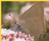
Gold Hunter's Hairstreak ( Satyrium auretorum )