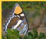
California Sister ( Adelpha californica )