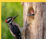
Nuttall's Woodpecker ( Picoides nuttallii )