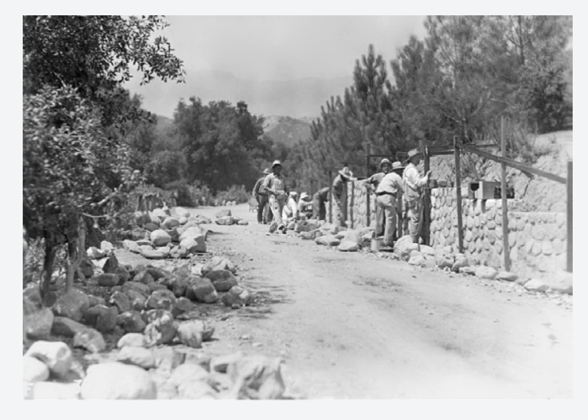
View of Works Progress Administration work crew at Dexter Park (1937)