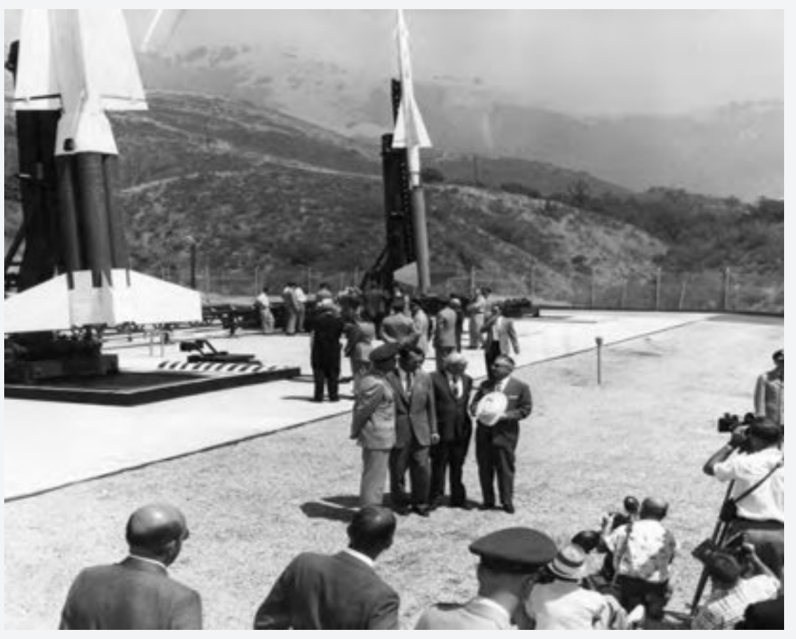
Opening of Nike Site LA-88 (1956)