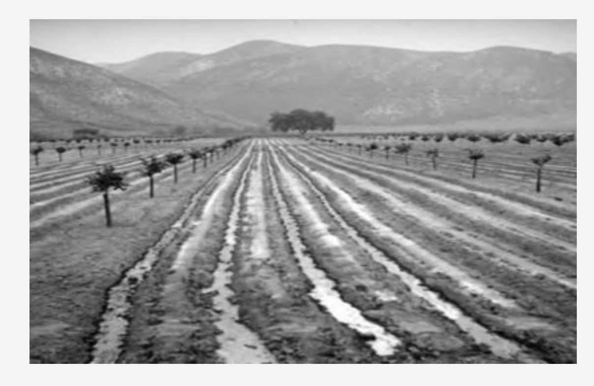
San Fernando Valley Orange Grove (1937)

Small farmsteads with citrus, olive, and avocado groves alongside natural creeks and washes.