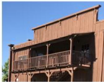
False Front/ Ornamental Parapet