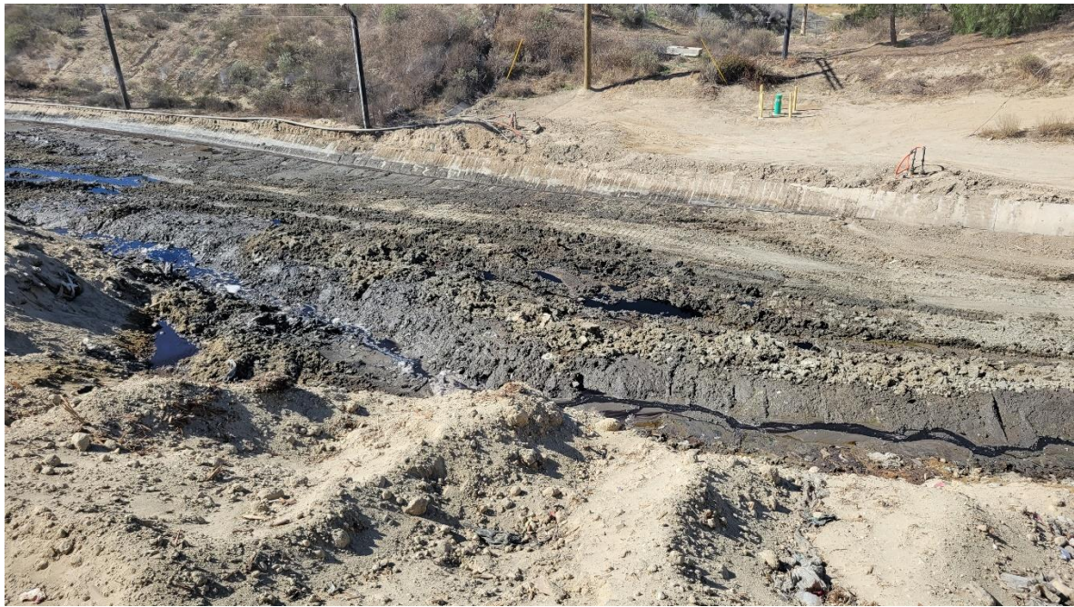
Photo 3. Location of western leachate outbreak, CCL November 2, 2023.