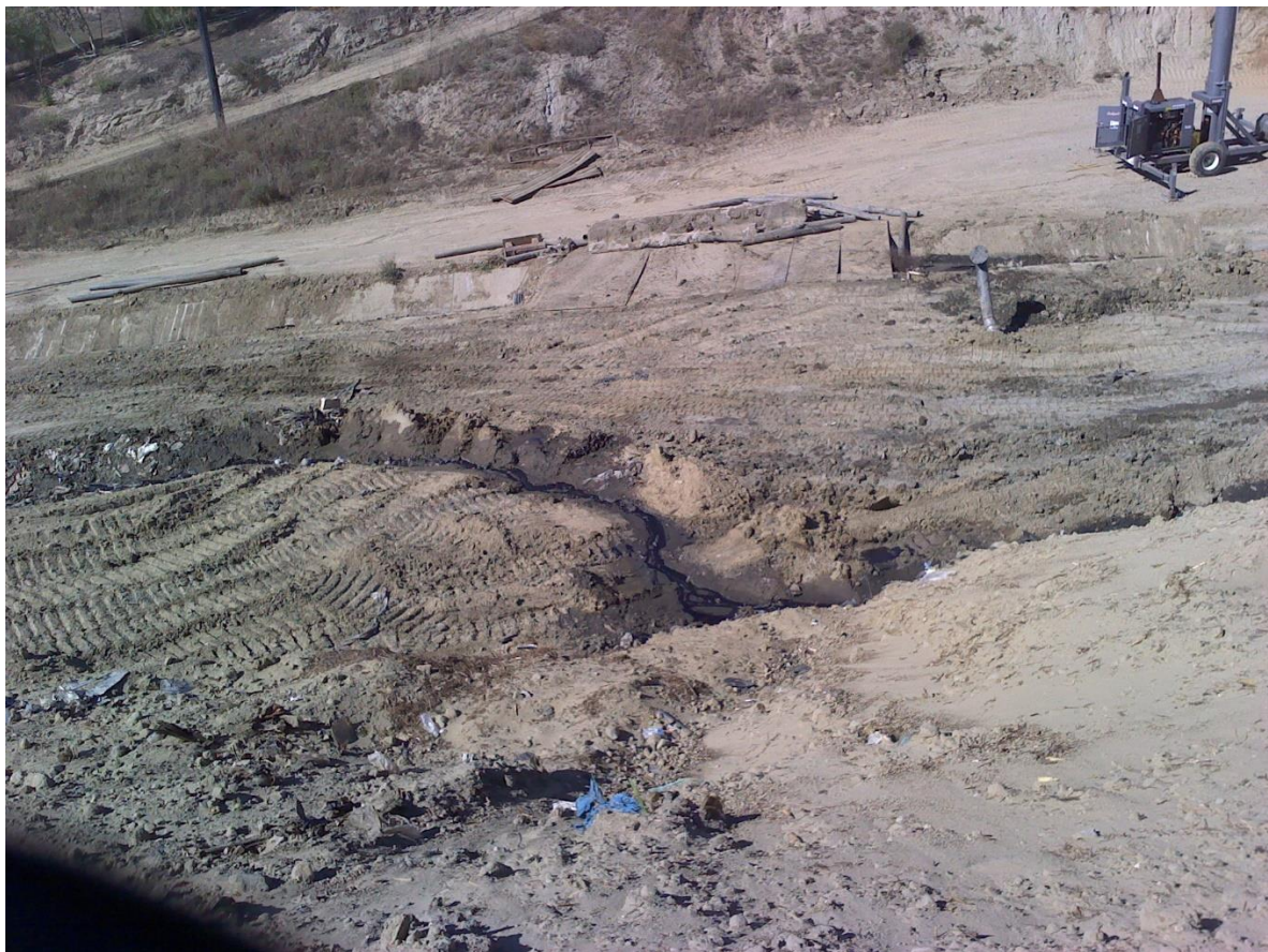
Photo 4. Location of western leachate outbreak, CCL November 2, 2023.