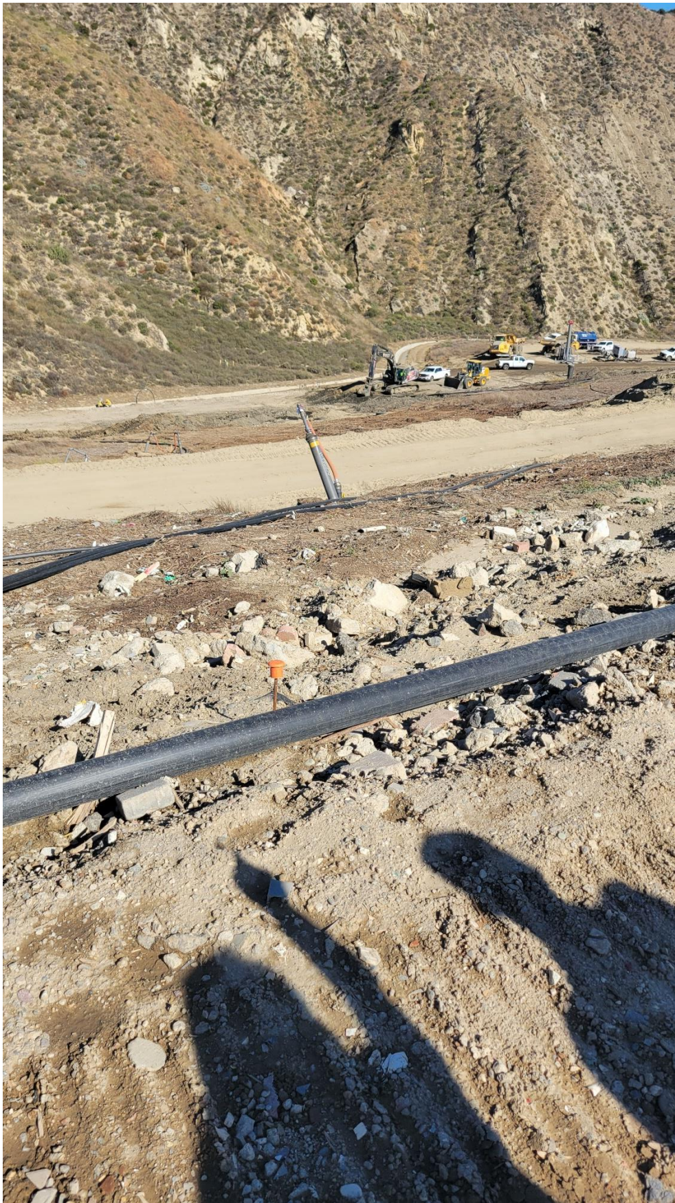
Photo 1. Location of northern leachate outbreak, CCL November 2, 2023.