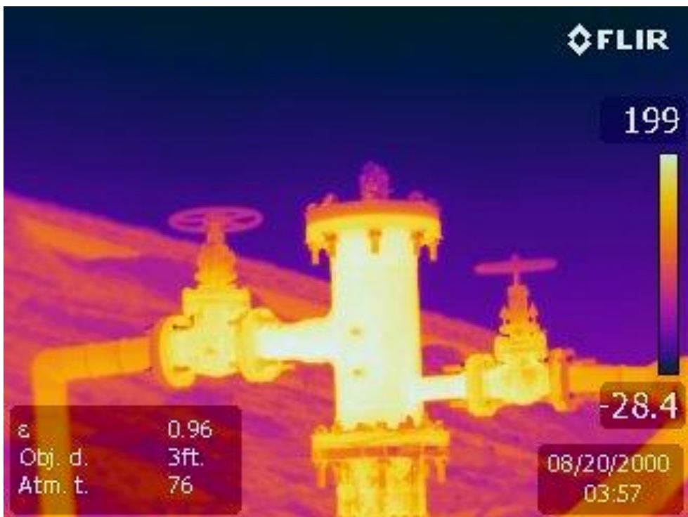
Photo 6. FLIR image of gas well with temperature range up to 199°F at CCL, November 2, 2023