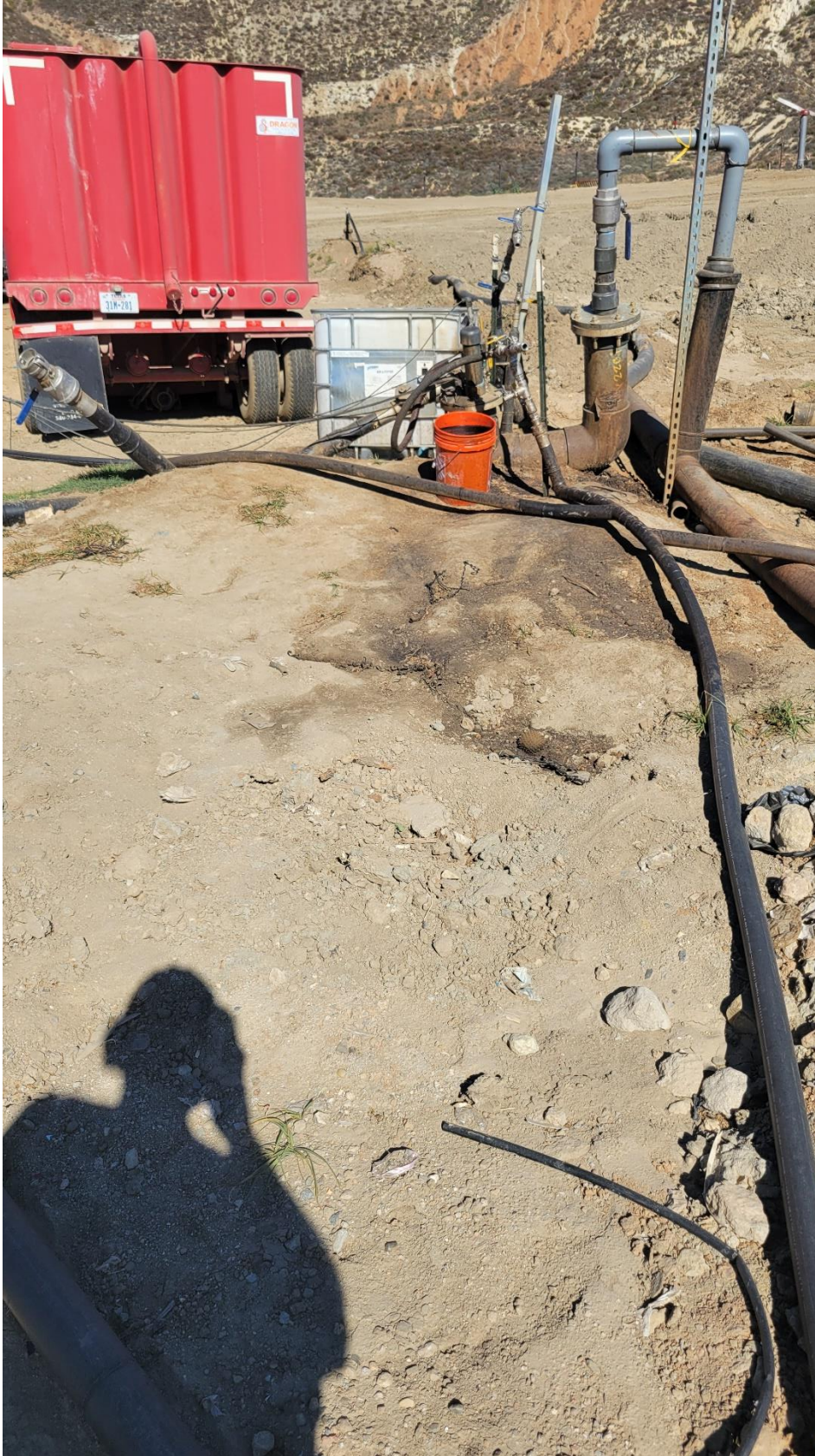
Photo 2. Gas well CV-2201 at CCL, November 2, 2023.