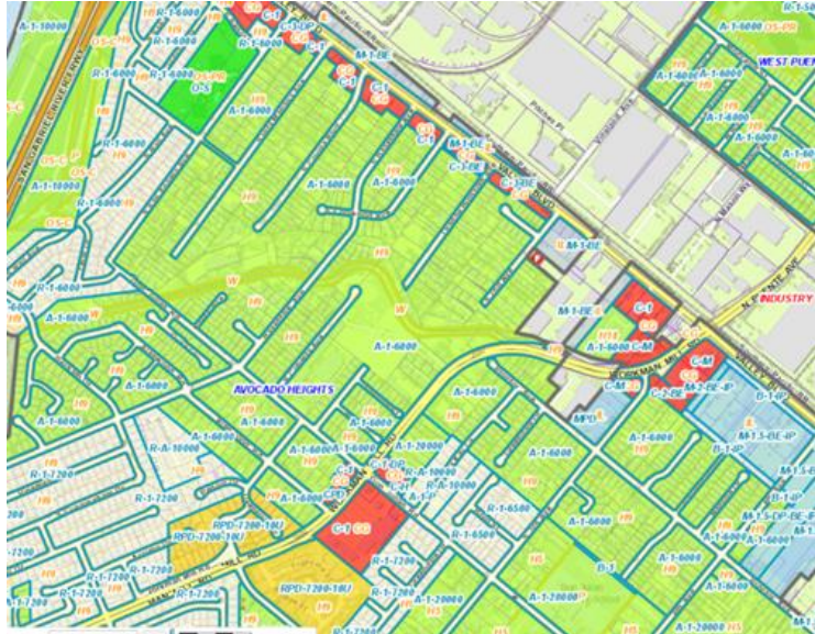
EXISTING AVOCADO HEIGHTS ZONING

The proposed East San Gabriel Valley Area Plan focuses on the unique needs and characteristics of 24 unincorporated communities within the East San Gabriel Valley Planning Area. The Area Plan consists of goals and policies on land use, economic development, community character and design, conservation and natural resources, mobility, and parks and recreation. The Area Plan also includes community specific goals and policies for each community or grouping of communities. Zoning and land use policy map changes are also proposed as part of the Project. The Project also consists of new regulations and updates to existing standards.