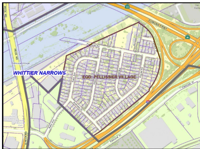
Pellissier Village Equestrian District

For more information, please visit the project web page at: https://planning.lacounty.gov/esgvap .