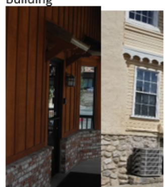
Stone or Rough Brick Veneer at the Base of the Building