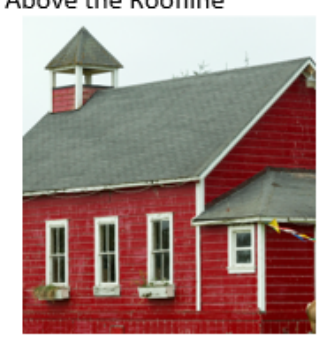
Square Tower or Cupola Above the Roofline