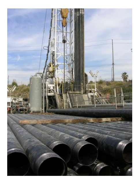
Drill Site – 100-Foot Noise Monitor