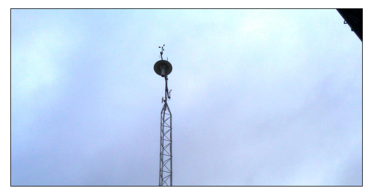
Met Station – Data Logger