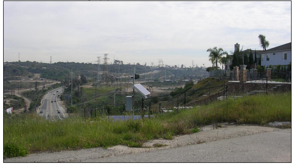
Permanent (Northeast Location) and Portable Noise Monitoring Equipment

Permanent Noise Monitoring Equipment –Northwest Location