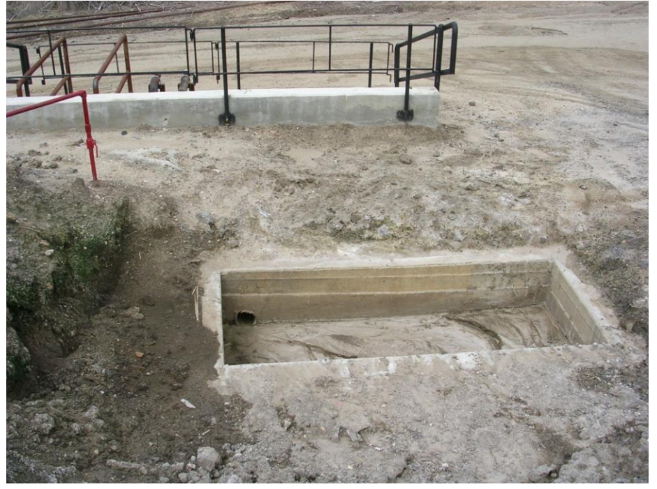
Biofarm LAI North – Odorant System