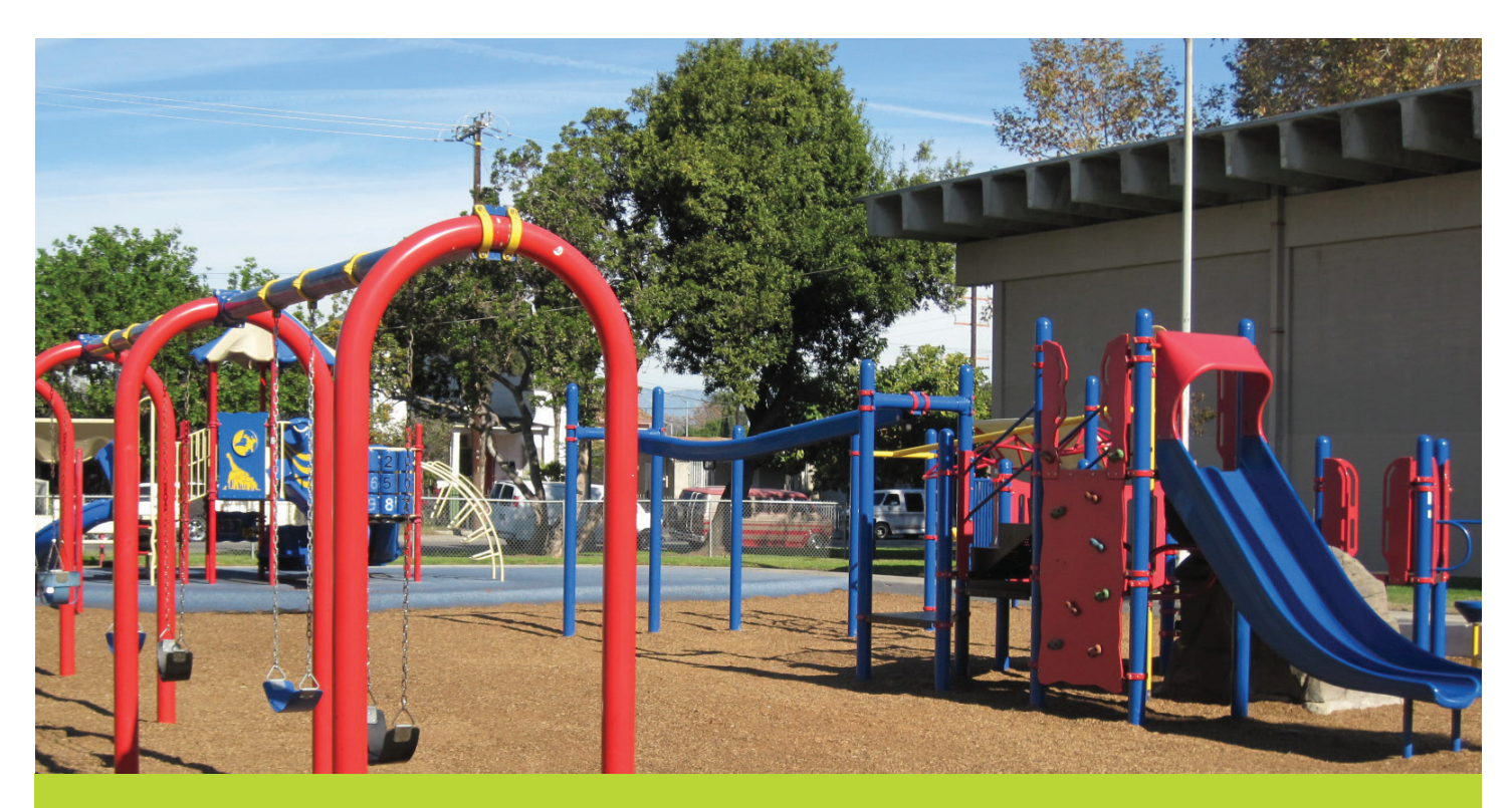
For more information, please visit: http://planning.lacounty.gov/ffcp

The Florence-Firestone Community Plan is a long-range, comprehensive plan for the unincorporated community of Florence-Firestone. The plan is an outgrowth of a visioning process conducted in 2009, which yielded a vision document based on community feedback. The Community Plan is based on the framework established in the vision plan and includes specific goals, policies, and implementation actions to guide future development and maintenance in the community.