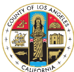
Antelope Valley Area Plan